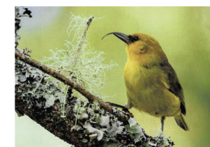
akiapola'au, the Hawaiian Honeycreeper